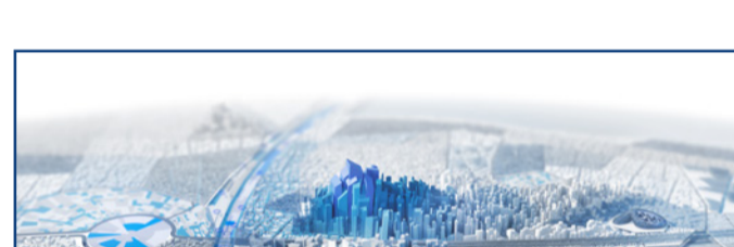
Architecture, Engineering, and Construction Collection

Get the most out of your favourite software. Industry collections combine leading products with specialized solutions to optimize your workflows so you can do more, faster, with greater confidence.